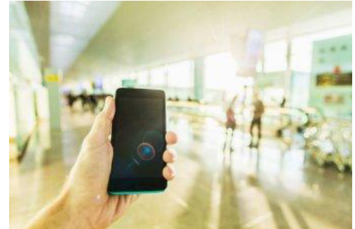
PHOTO: Airport authorities have the right to confiscate devices and copy their contents.