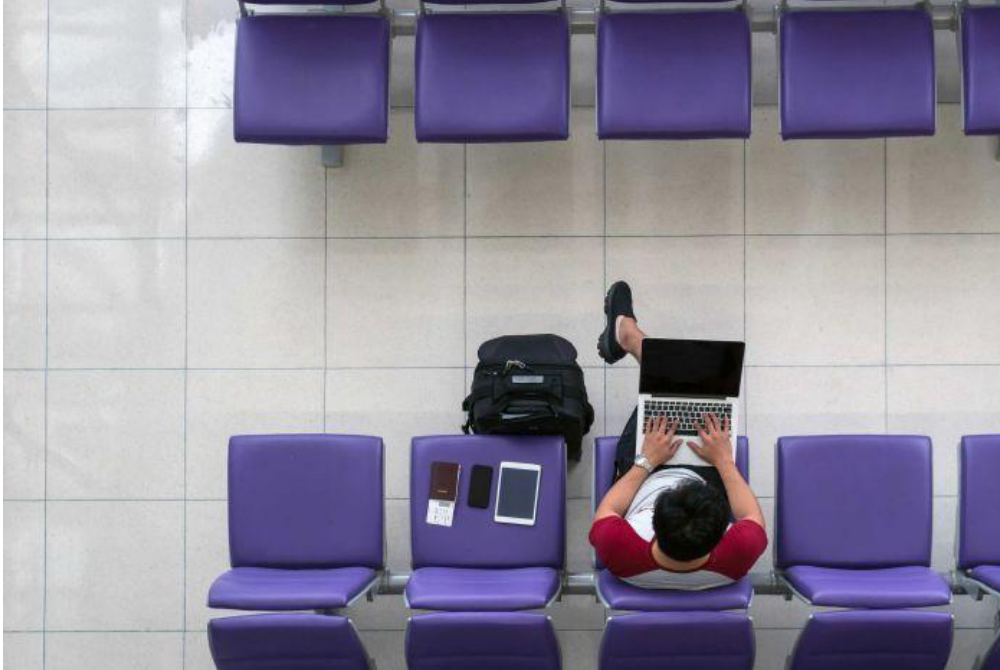
PHOTO: The Australian Border Force says no examination is random.

At no other time in history has airport security been so rigorous: travellers have come to expect pat downs, bag screenings and random drug detection tests.